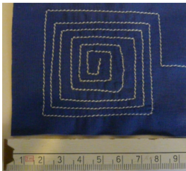
Fig.1. Textile antenna made from inox thread "square"

The completed antenna is then, in laboratory conditions, connected to a source of different wavelengths while the extent of the signal emission and its strength is being tested. Textile antennas made of inox threads suitable for wearing on clothes or sewn into clothes offer a more convenient processing for wearing as opposed to standard antennas. Nevertheless, characteristics of pure copper or gilded antennas cannot be expected.